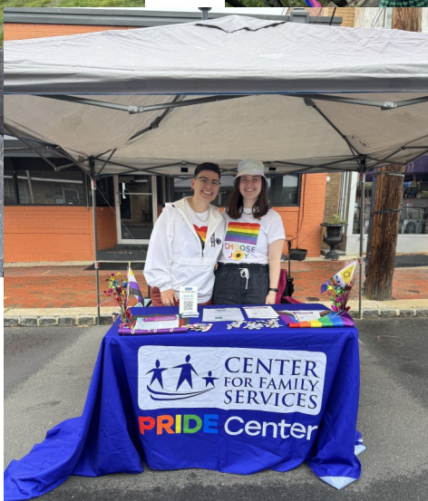
Pride at Peak Fashion Show in Audubon