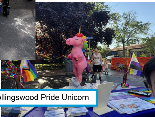
Pinky the Collingswood Pride Unicorn